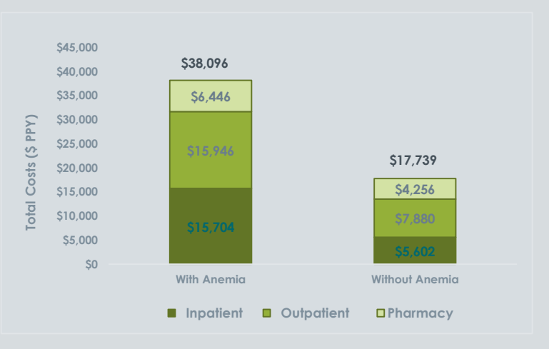
Figure 2. Adjusted Healthcare Utilization in Stage 3-5 NDD-CKD Patients with Anemia vs. without Anemia

Figure 3. Unadjusted Costs in Stage 3-5 NDD-CKD Patients with and without Anemia